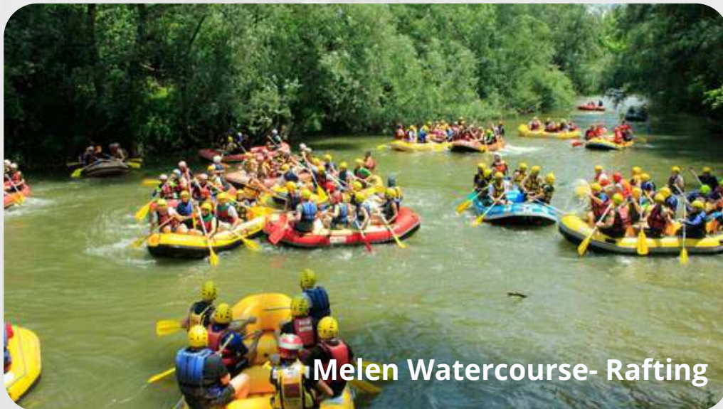
Melen Watercourse- Rafting

Sakarya province hosts numerous activities intertwined with nature. In the city, activity areas such as ski centers, paragliding, and rafting are located 20 minutes away from the campus. Bicycle use is widespread with urban cycling routes. Transportation is also provided by minibusses and buses.