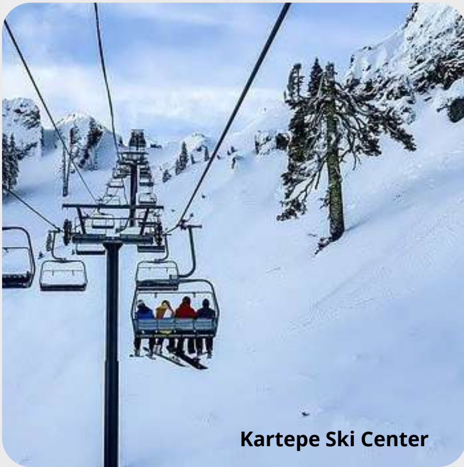
Kartepe Ski Center